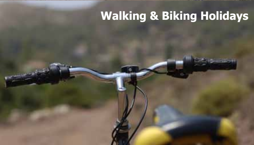
Walking & Biking Holidays